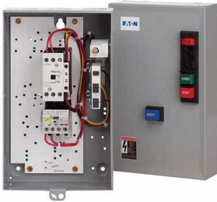
Non Combination Control with Cover