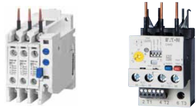
Thermal Overloads Solid State Overloads