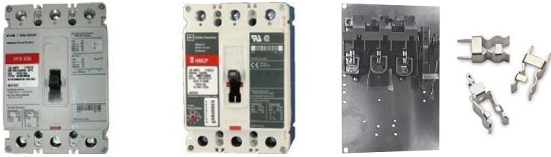
Thermal Magnetic Breaker Motor Circuit Protector Non Fused Switch Fused Switch